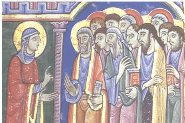
13th century St Alban's Psalter

For hundreds of years, the combination of all of these stories about women in the gospels have fired imaginations with many depictions of Mary Magdalene. The most usual story is that Mary Magdalene was a prostitute who repented and followed Jesus. But that is not what the gospels say. One of the difficulties is that there are a number of Marys in the gospel, it was a popular name for Jewish girls going all the way back to the time of Moses and the leader and prophet Miriam. Mary of Magdala was named by the